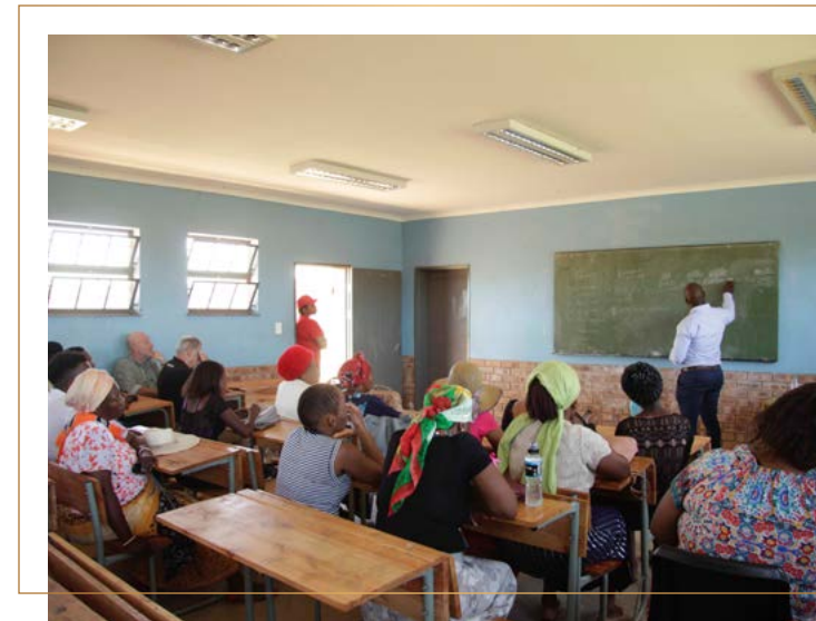
K-Fastigheter is one of Dandelion's partners for education projects in South Africa.